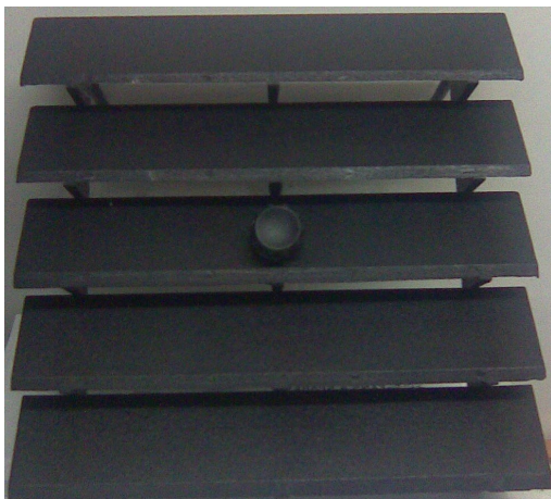
PSG - Directional Air Vanes

All other types of grille available to order, contact our office for current availability & delivery dates.